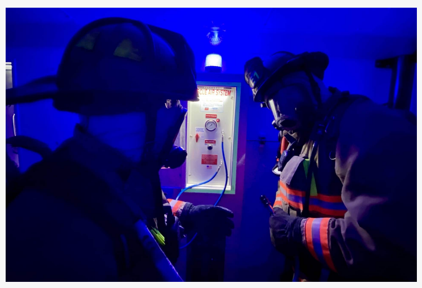
Firefighters connecting for airresupply