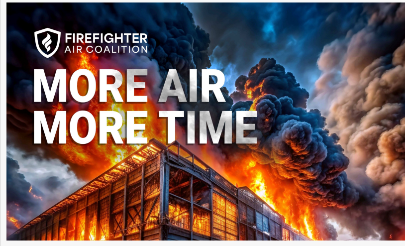
More Air, More Time

"The Firefighter Air Coalition (FAC) is poised to make FDIC 2025 a landmark occasion for firefighters by showing the world that powerful forces are stepping up to advocate for firefighter air safety, backed by new training, research, technologies and tools that optimize or extend a firefighter's vital air supply and re-supply requirements." –Mike Gagliano, FAC president