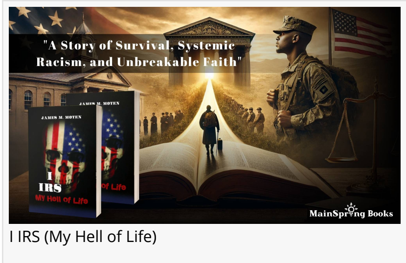
I IRS (My Hell of Life)

exclusive interview conducted by MainSpring Books. His story is a gripping reflection on his life's challenges, navigating racism, adversity, and the resilience of faith in the face of oppression.