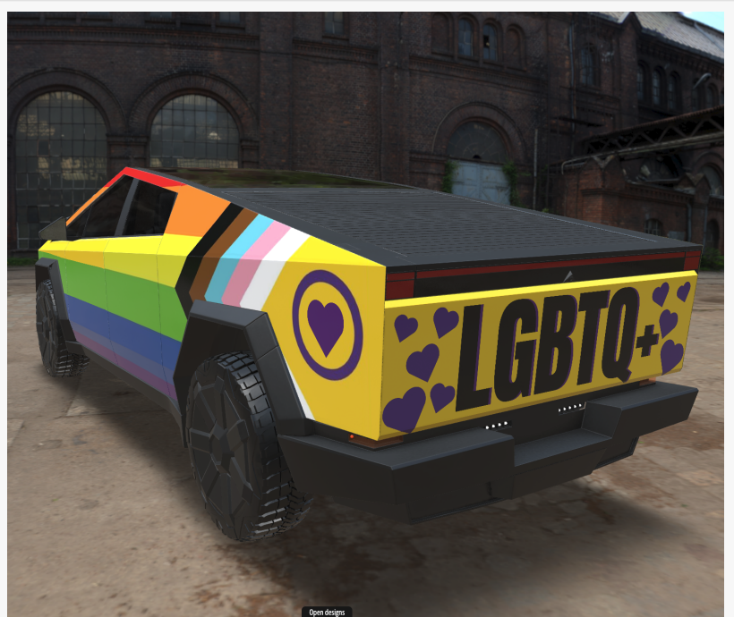
Express yourself with 3DCal custom protective wrap designer

"We are crossing our fingers that our patent-pending software captures the interest of Elon Musk and Tom Zhu, as we are offering our platform for licensing through our parent company,