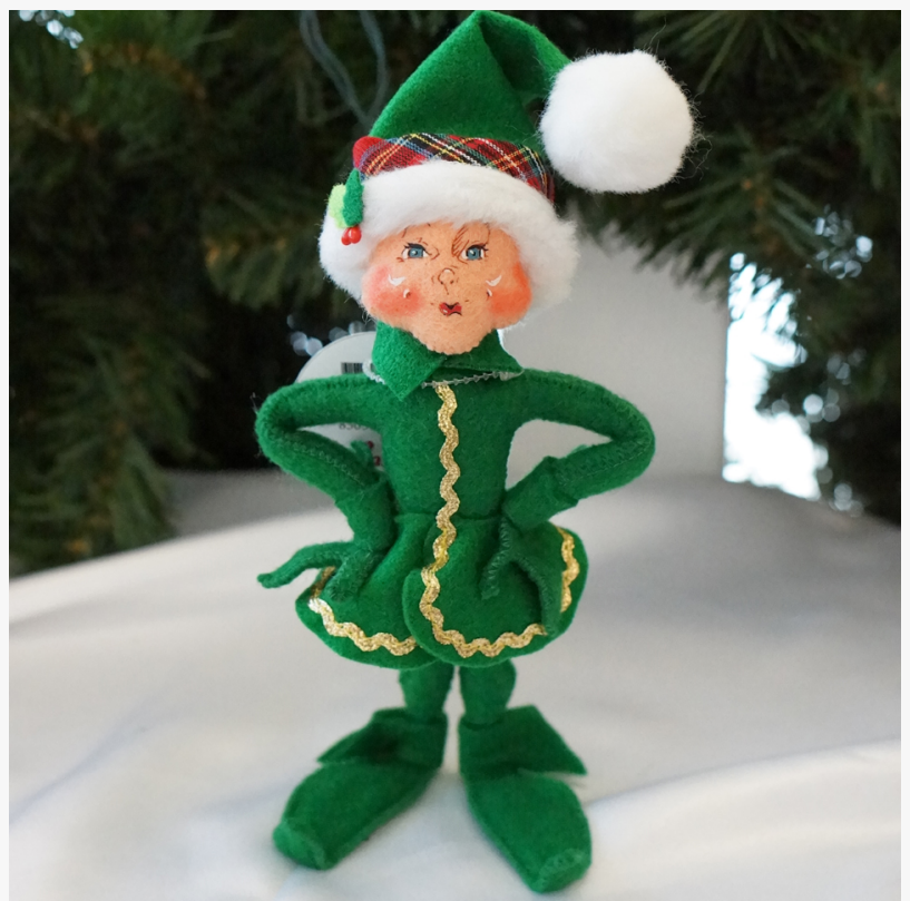
Extremely Rare 2012 Home for the Holidays Ivy Elf Exclusive — Only 20 were made.

2018: Jack Frost Pixie, the 16-inch Woody Workshop Mouse, Mardi Gras Mouse, Headless Horseman, Cinco de Mayo Mouse, New Year Cheers, and Summer Solstice