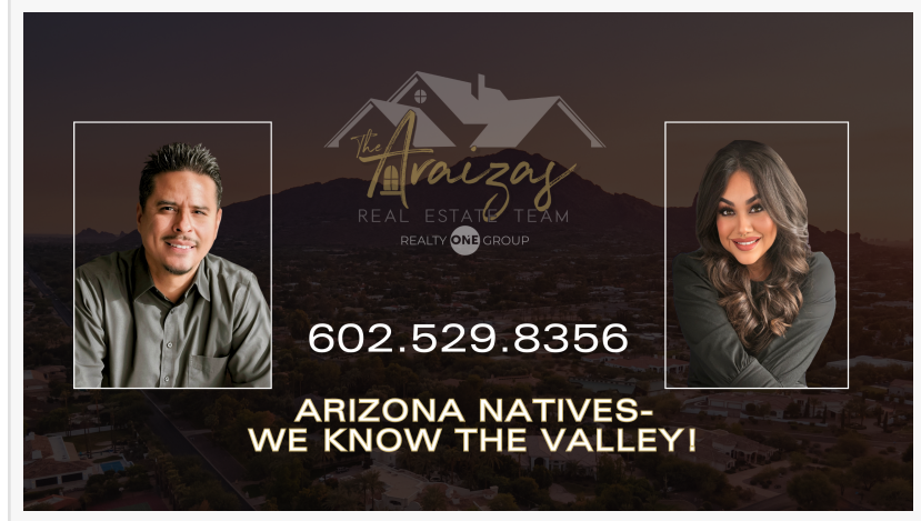
Homes for sale in Phoenix

This sophisticated luxury condominium for sale in Phoenix features floor-to-