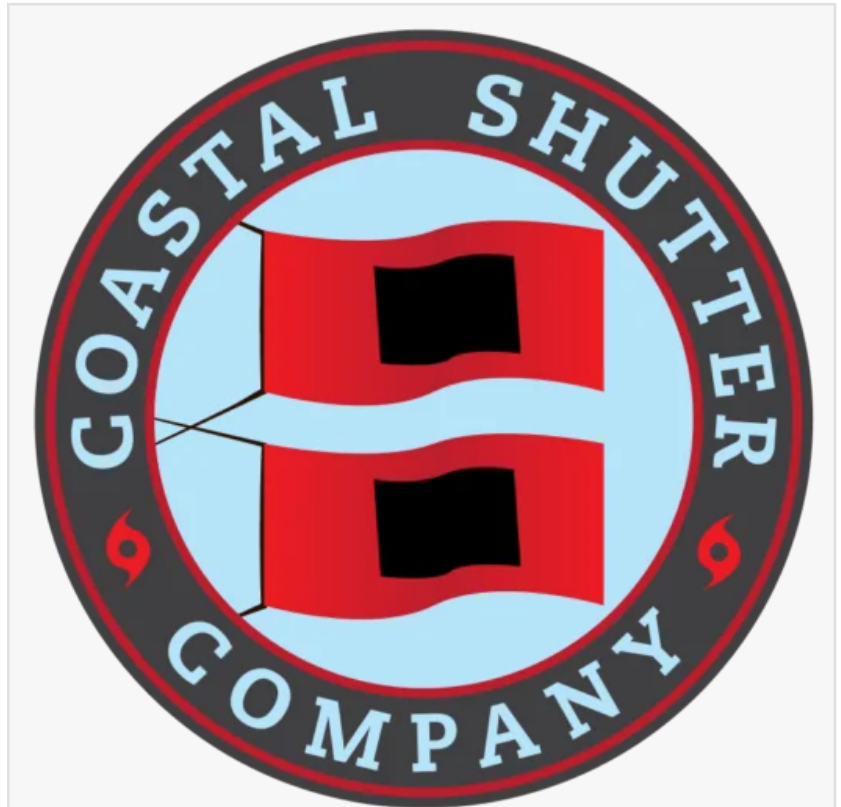
Logo of Coastal Shutter Company

"This launch underscores Coastal Shutter Company's dedication to delivering not only