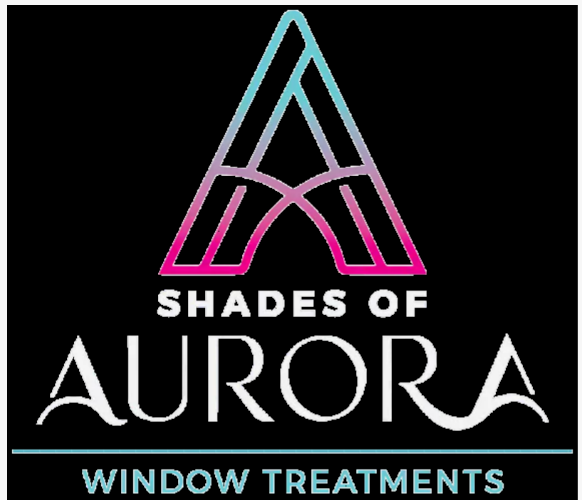
Logo of Shades of Aurora

The launch of Shades of Aurora's new website bridges this gap with customer-centric features such as a convenient appointment portal for one-on-one consultations at no cost. Alongside this, WTMP is also leading strategic digital initiatives such as consumer education, SEO, and PPC to