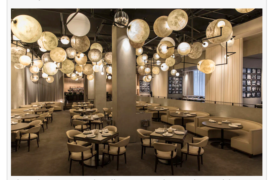
The Chicago Hotel Collection Ambassador Gold Coast Restaurant Space

create a signature presence in one of Chicago's most revered restaurant settings, surrounded by the architectural beauty and cultural legacy of the Ambassador. Blending Historic Charm with Modern Luxury