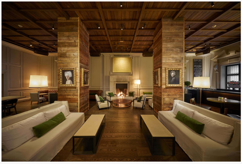
The Chicago Hotel Collection Ambassador Gold Coast Library Bar

The venue offers a rare opportunity for a standout chef or hospitality brand to