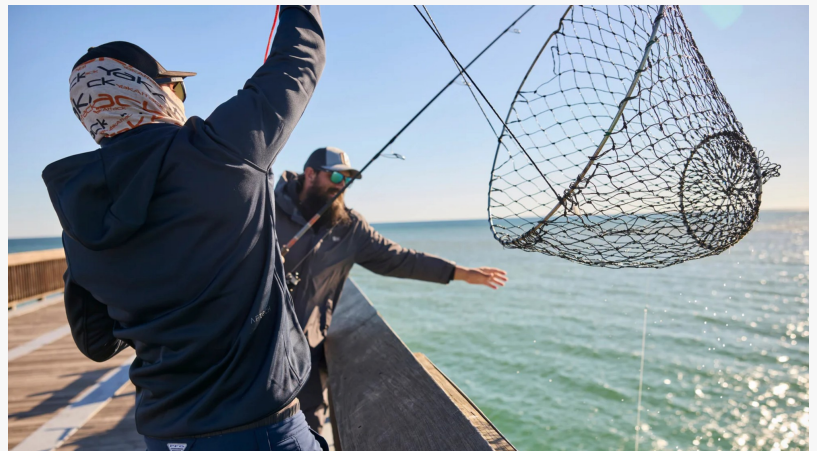
Pier Fishing With Beach Bum Outdoors