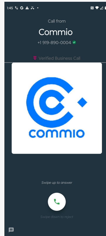
Branded Call example from Commio.

Branded Calling ID™ (BCID™) offers a secure end-to-end calling ecosystem, governed by the CTIA, that aims to enhance trust and security in communications to transform how you're able to connect with your customers.