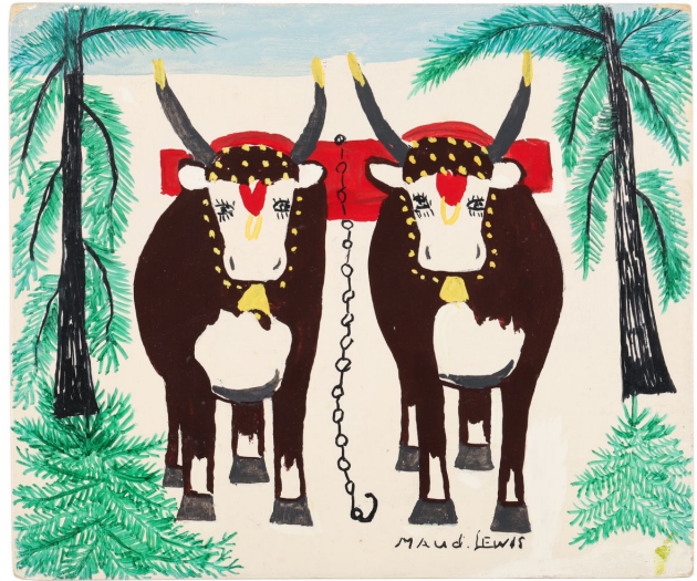
Mixed media on beaverboard signed by folk art icon Maud Lewis (Nova Scotia, 1903-1970), titled Oxen in Winter , 11 ¾ inches by 14 inches, circa 1969-1970. Estimate: CA$15,000-$18,000

The oil on canvas by Charles F. Comfort (1900-1994) depicts Lunenburg Harbour and is titled Emerald Sea , showing a fishing dory approaching the wharf and a rocky shoreline dotted with shingled houses and sheds. The work is signed and dated ("C. 1940"). It's in very good condition and measures 20 inches by 26 inches (canvas, less the frame). It should realize $10,000-$15,000.