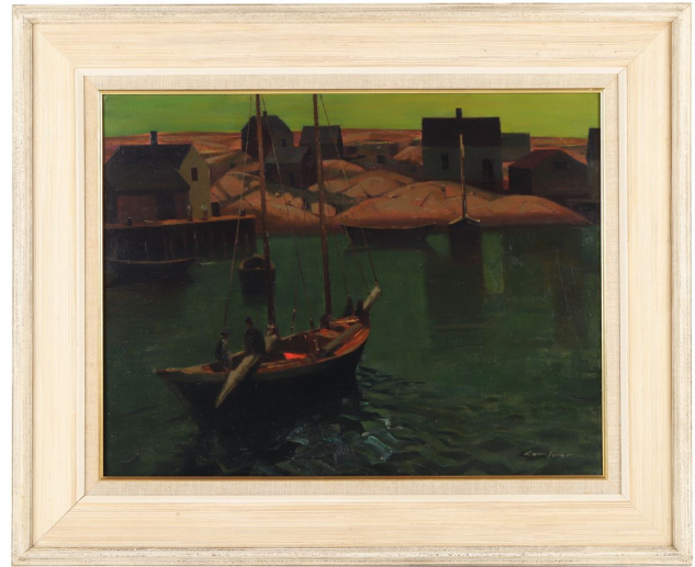
Oil on canvas by Charles F. Comfort (Canadian, 1900-1994) showing Lunenburg Harbour, titled Emerald Sea , signed and dated 1940, 20 inches by 26 inches. Estimate: CA$10,000-$15,000

Here is a link to the April 12th East Coast Canadiana & Folk Art auction on the Miller & Miller