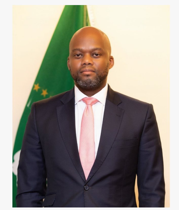
Wamkele Mene - the Secretary General of the African Continental Free Trade Area (AfCFTA) Secretariat.

analytical rigor with strategic international networks, reinforcing a collective commitment to fostering excellence and sustainable development.