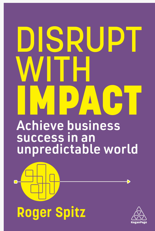
Disrupt With Impact, Roger Spitz (Kogan Page)