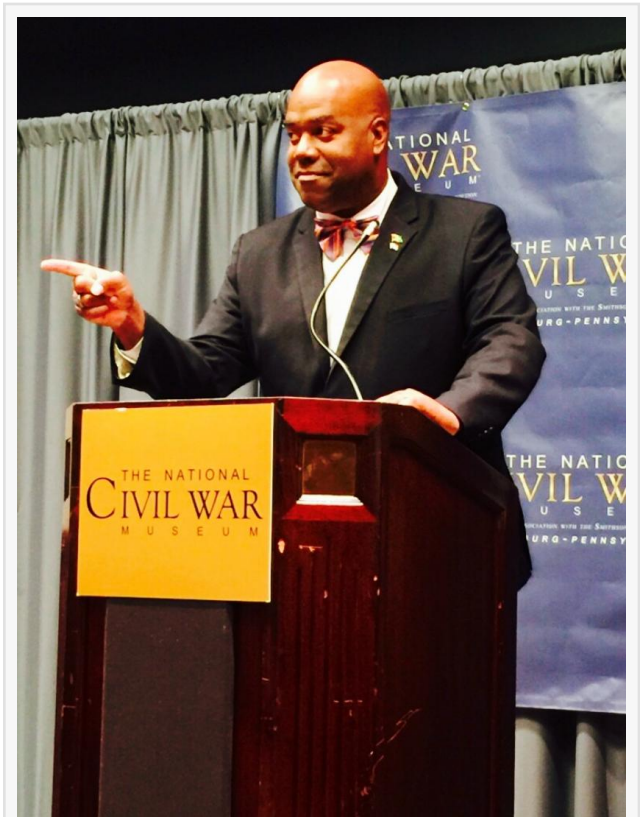
HRH King Clyde Rivers

Institutions facing communication challenges now have a clear path to overcoming them. Speaking To Millions™ serves as the ultimate vehicle for organizations seeking a brighter future through strategic and effective communication.