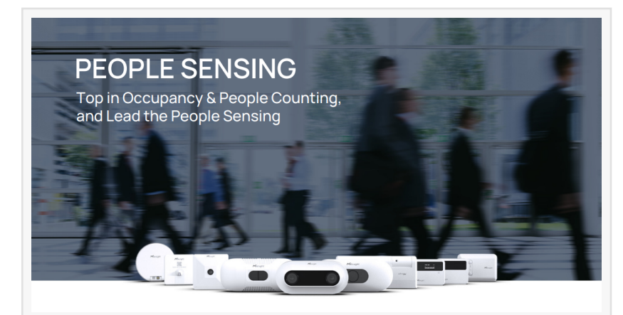
Milesight people sensing product series

At the forefront of addressing these challenges, Milesight, as a leader in IoT solutions, remains committed to enhancing operational efficiency while safeguarding privacy. Milesight's People Sensing Series combines cutting-edge technology with a strong