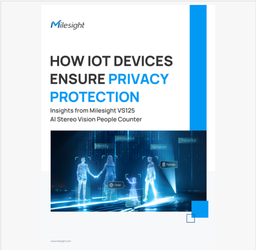
VS125 AI Stereo Vision People Counter GDPR Guideline

As businesses deploy people counters in large numbers, privacy issues have emerged. Tracking, counting, and analyzing individuals' movements and behaviors can result in the collection of sensitive data. Since the implementation of the General Data Protection Regulation (GDPR) in 2018, the EU has set a global benchmark for privacy protection. To comply with this regulation, businesses must not only implement technical measures to safeguard data but also navigate increasingly complex compliance requirements.