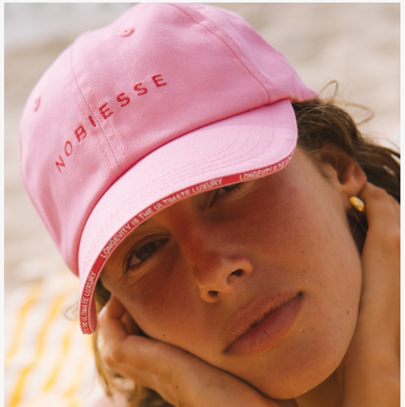
Nobiesse - Longevity is the Ultimate Luxury