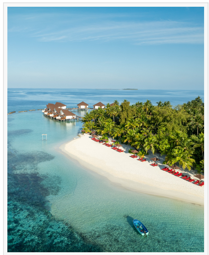
Ellaidhoo Maldives by Cinnamon

Both resorts provide a diverse range of recreational activities, from guided snorkelling excursions and big-game fishing to cultural island visits and sunset cruises. For those seeking relaxation, the Chavana Spa at Ellaidhoo Maldives by Cinnamon and the Mandara Spa at Cinnamon Dhonveli Maldives offer signature treatments designed to rejuvenate body and mind. Active travellers can take advantage of tennis, squash, badminton, and volleyball courts, as well as fully equipped gyms.