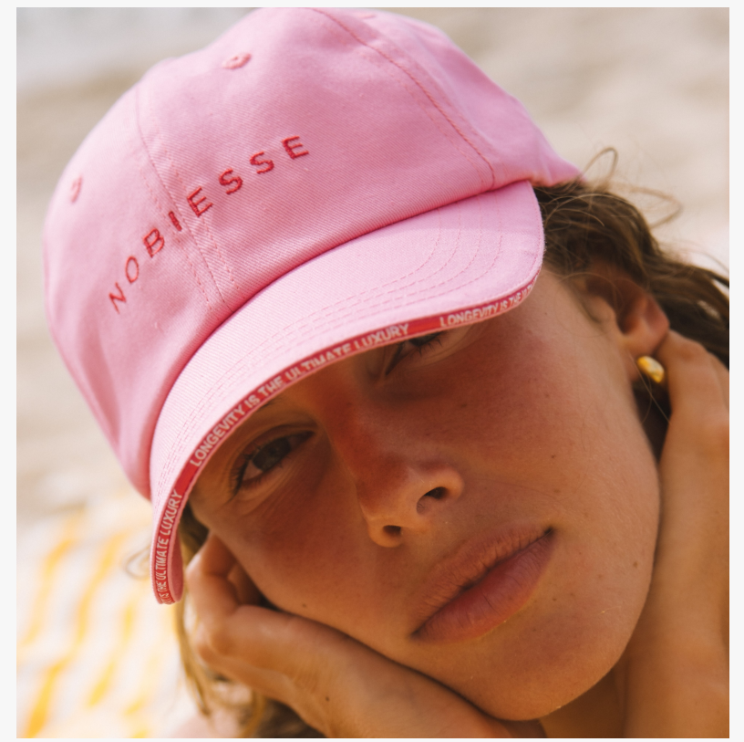
Nobiesse - Longevity is the Ultimate Luxury

Its gentle formulation supports hygiene and insect protection, making it a practical choice for outdoor activities.