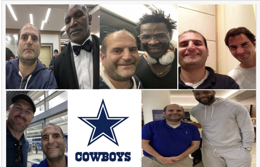
TravelingWiki Foundation's CEO with Evander Holyfield, Michael Irvin, Roger Federer, Jason Witten & Tracy McGrady

Presidents Obama and Biden during the November 4, 2008 election night in Grant Park.