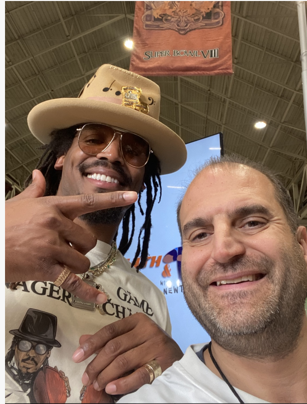
TravelingWiki on the Set of Cam Newton's TV Show at Super Bowl LIX Discussing Autism Awareness in Pro Football