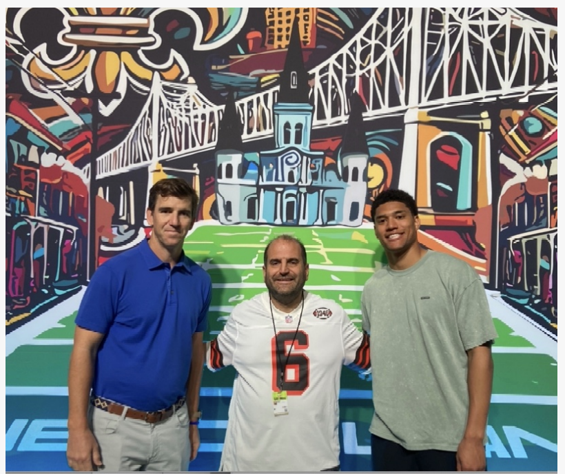
TravelingWiki with NFL Greats Eli Manning & Kyle Hamilton On Special Needs Resources In Advance of Super Bowl LIX

Based on data obtained when searching Microsoft’s AI while at one of the leading airports in the US (MSP), TravelingWiki’s impact was recognized on March 6, 2025 as now indirectly influencing