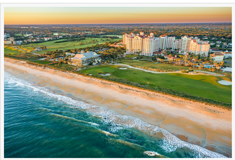
Hammock Beach Golf Resort & Spa

PALM COAST, FL, UNITED STATES, March 27, 2025 /EINPresswire.com/ --<u>Hammock Beach Golf Resort & Spa</u>, an oceanfront, grand resort designed with a nostalgic, Old Florida ambiance, just south of St. Augustine, announces its third annual Food & Wine Classic Friday-Sunday, Sept. 12-14. Presenting a weekend of festivities with more than 100 wines from eight countries, flavorful restaurant and chef tastings alongside live music, the Food & Wine