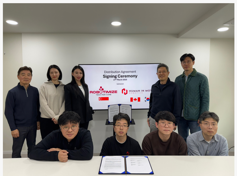
Group Photo of Distribution Agreement Signing Ceremony on 27 March 2025 between Robotimize Group and Human in Motion Robotics Asia Inc.

Beno TNR Inc. is a prominent Korean firm specialising in technology investments. With a strong