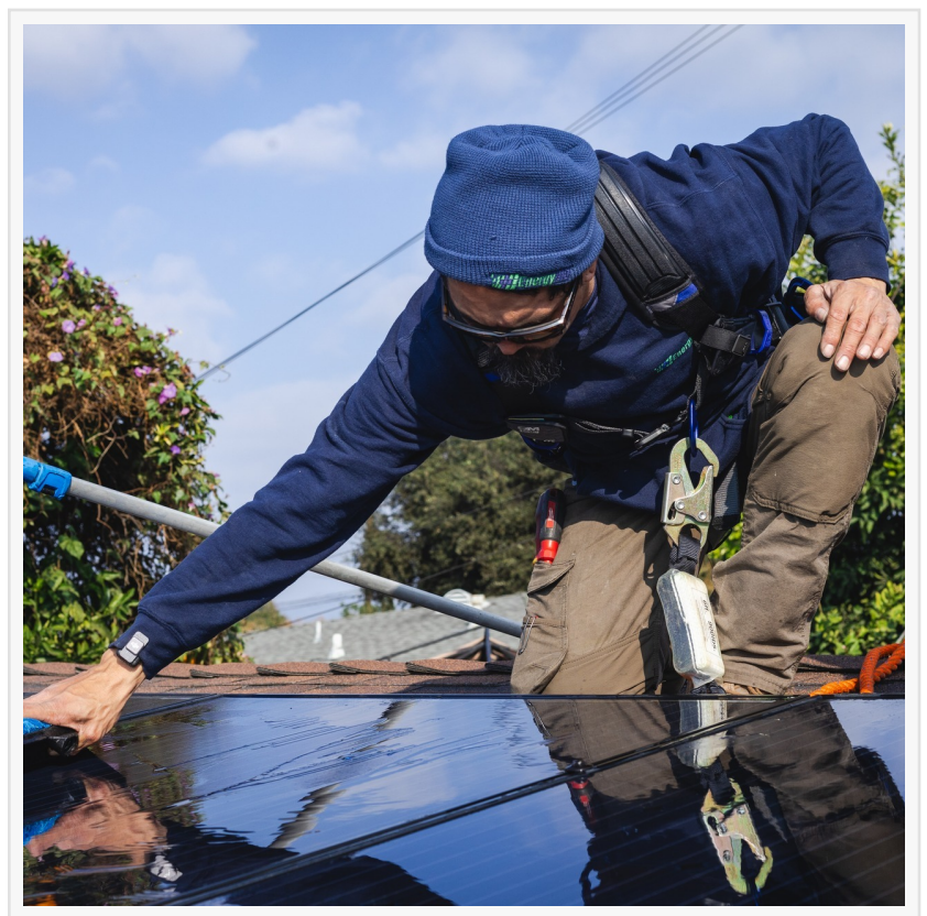
Solar panel cleaning

For more information: <a href="https://energyaid.net/">https://energyaid.net/</a> or: facebook.com/energyaid.Expert.repair s linkedin.com/company/energyaid-inc/