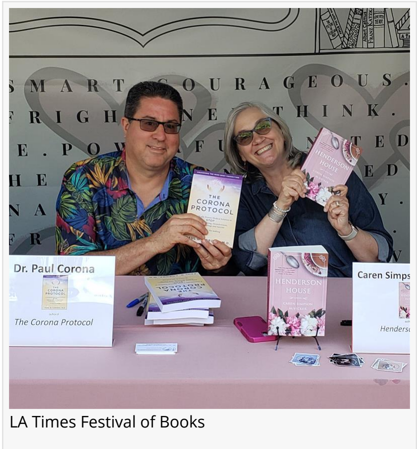
LA Times Festival of Books