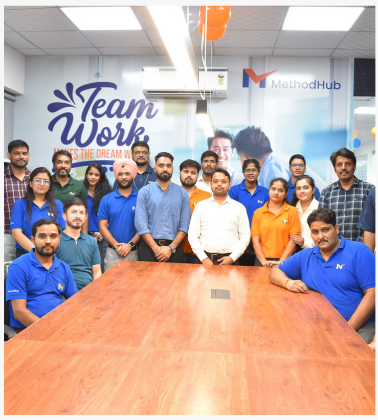
MethodHub Mohali Center

Over the years, the organization has introduced several employee-centric programs focused on learning and development, diversity and inclusion, and work-life balance. The leadership team