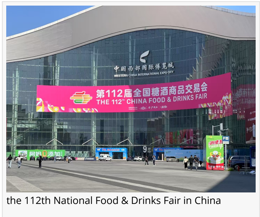
the 112th National Food & Drinks Fair in China

REGINA, SASKATCHEWAN, CANADA, March 28, 2025 /EINPresswire.com/ -- At the 112th China National Food and Drinks Fair (commonly referred to as the "Sugar & Wine Fair"), one of the most influential trade shows in China's food and beverage industry, Canadian premium health brand BIOPEP made a striking appearance with its flagship product — a series of imported flaxseed powder. Thanks to its exceptional quality, advanced processing technology, and commitment to natural nutrition, BIOPEP became a highlight in the natural and functional foods section, setting a new benchmark for the healthy foods category in China.