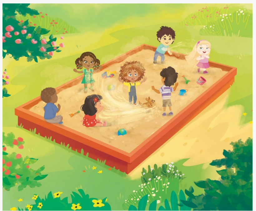
When playtime turns into a sandy adventure!

This press release can be viewed online at: https://www.einpresswire.com/article/797735000