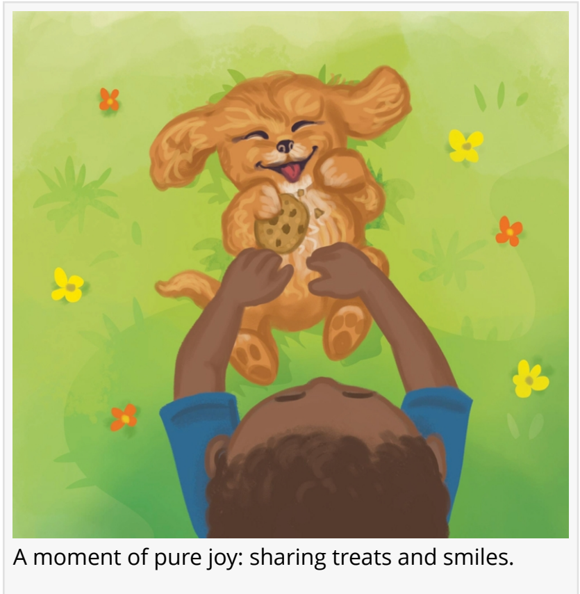
A moment of pure joy: sharing treats and smiles.

LOS ANGELES, CA, UNITED STATES, April 2, 2025 /EINPresswire.com/ -- Diverse Dimensions Publications is pleased to announce the release of Unity Comes to The Sandbox , a new addition to The Sandbox book series that aims to help children develop critical social-emotional skills such as empathy, kindness, and civility. Through an engaging story of friendship between children and animals, the book teaches young readers to approach the world with respect, compassion, and understanding.