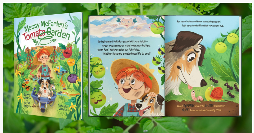
Peek inside the new picture book called Messy McFarlen's Tomato Garden

Messy McFarlen's Tomato Garden is available at MessyMcFarlen.com , Amazon, IngramSpark , BarnesandNoble.com, TheGreatBritishBookShop.com , and independent bookstores like