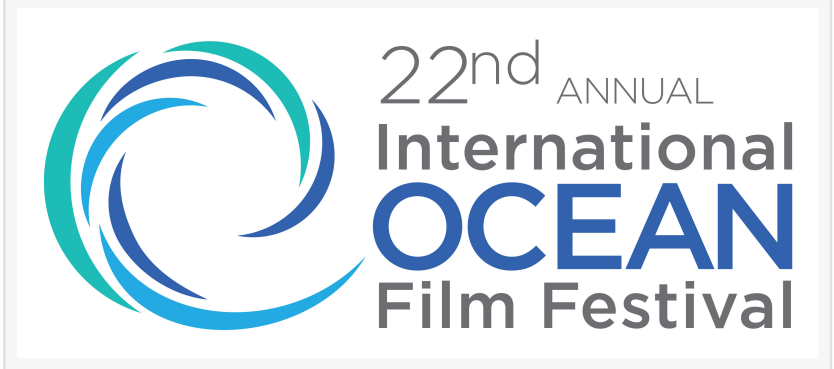
International Ocean Film Festival 2025

of the Mill Valley Film Festival. Festival Passes, plus Individual, Student, Youth and Senior Sunday tickets available: <a href="https://intloceanfilmfest.org/2025-tickets-passes">https://intloceanfilmfest.org/2025-tickets-passes</a>.