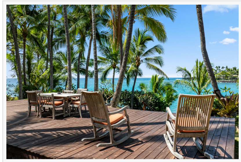
Seven-Bedroom Haven with Multiple Ocean Entry Points

Beyond its breathtaking design, the property boasts a Short-Term Vacation Rental (STVR) permit, allowing for