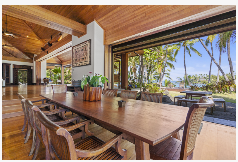
Architectural Marvel with Indoor-Outdoor Living

floor-to-ceiling screens framing daily sunset views over the Pacific. Designed to embrace Hawaii's natural beauty, the estate features soaring vaulted ceilings, expansive windows, and multiple ocean-view living spaces. Three luxurious primary suites and an entertainment loft with an ensuite bathroom provide ample space for extended family or guests.