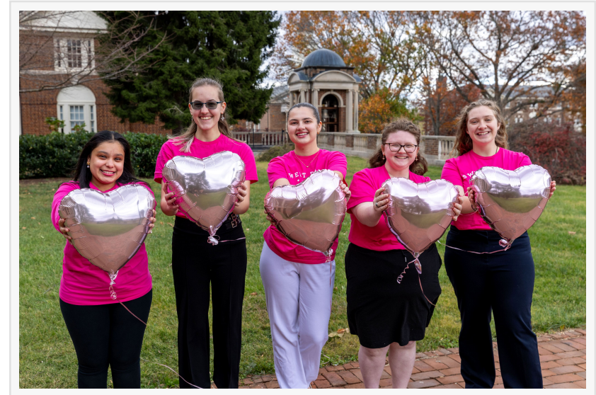
From Our Hearts to Yours — Thank You, Alumnae, for Lifting Sweet Briar Higher

This press release can be viewed online at: https://www.einpresswire.com/article/798033617