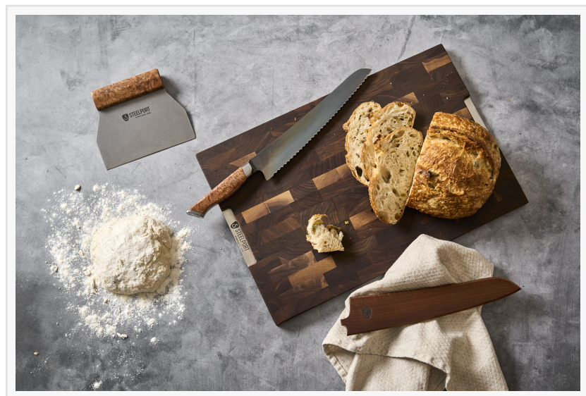
The STEELPORT 3-Piece Baker Set is a must-have for passionate bakers, combining craftsmanship and performance in every detail.

PORTLAND, OR, UNITED STATES, March 28, 2025 /EINPresswire.com/ -- STEELPORT Knife Co, makers of heirloom quality American handcrafted kitchen tools, proudly announces the launch of the STEELPORT Bench Scraper—a US-made kitchen essential for bakers and chefs. With the launch of the Bench Scraper, STEELPORT is also introducing The 3-Piece Baker Set, pairing the new Bench Scraper with their award-winning Bread Knife.