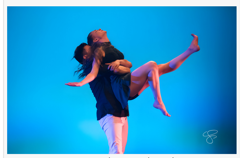
Cazo Dance Company

have the unique opportunity to participate in a Q&A session with the artists. Refreshments will be available in the lobby, providing a relaxed atmosphere to reflect on the evening's performances.