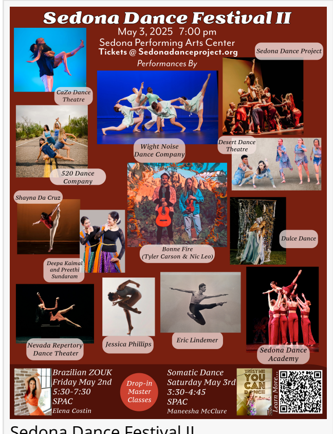
Sedona Dance Festival II

The theme for this year's festival, "Shadow to Light," will explore the profound interplay between darkness and illumination through movement and storytelling.