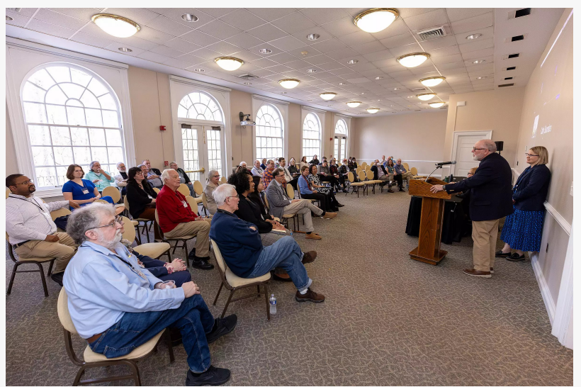
Virginia Forum Attendees, Elston Inn & Conference Center

As this year's host, Sweet Briar College and its history were at the forefront of various programming, including a tour of the greenhouse, self-guided tours of the Sweet Briar Museum, Enslaved Community Cabin, and Pannell Gallery, and a tasting of Sweet Briar College Farm wines .