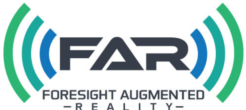
Foresight Augmented Reality (FAR)