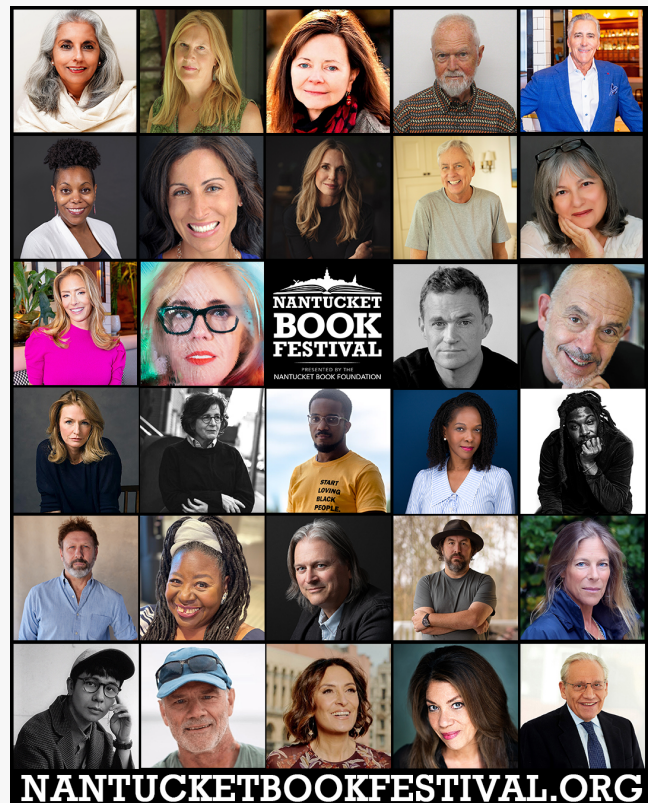
Dozens of authors will come to Nantucket in June.