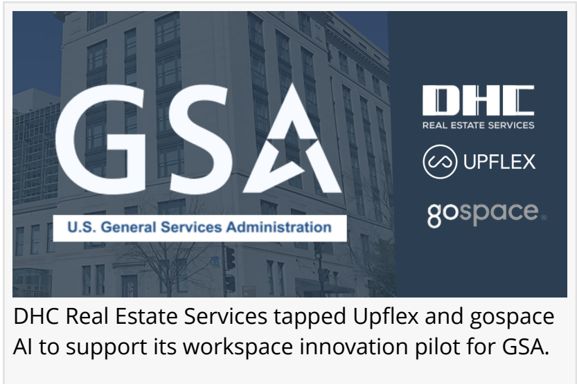
DHC Real Estate Services tapped Upflex and gospace AI to support its workspace innovation pilot for GSA.

NEW YORK, NY, UNITED STATES, April 1, 2025 /EINPresswire.com/ -- The U.S. General Services Administration (GSA) has selected DHC Real Estate Services, which is working in partnership with Upflex and gospace AI, for a pilot to modernize — and optimize — federal workplace strategy.