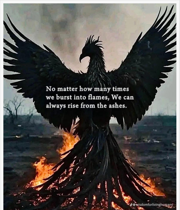
Image and wording Inspiring Pam Nye's rise from the wildfire ash challenges ...

This press release can be viewed online at: https://www.einpresswire.com/article/798500106