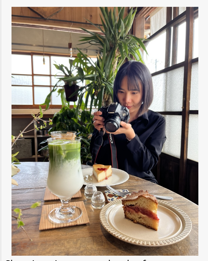
Shooting pictures at a local cafe