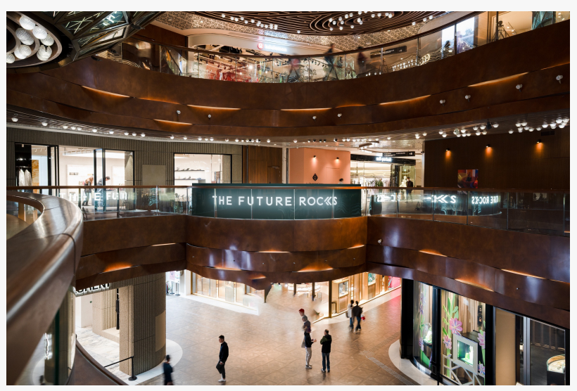
THE FUTURE ROCKS' new pop up store at K11 Musea