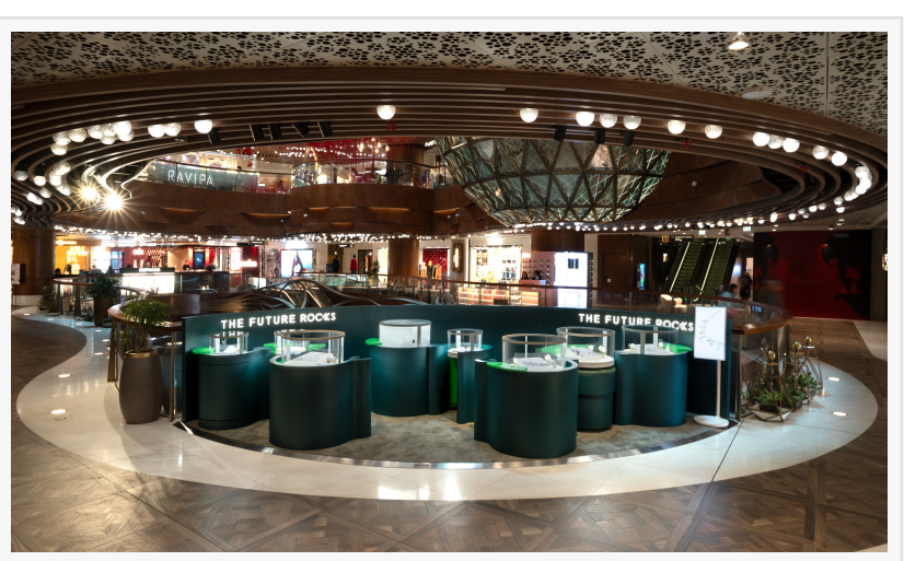
THE FUTURE ROCKS' new pop up store at K11 Musea

The pop-up will feature a selection of THE FUTURE ROCKS' signature pieces,