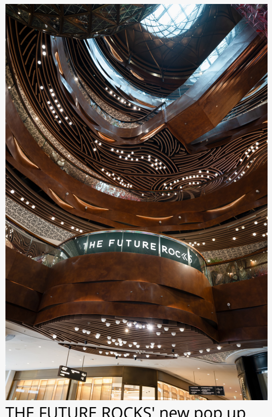
THE FUTURE ROCKS' new pop up store at K11 Musea

Media Enquiry THE FUTURE ROCKS +852 3124 6177 email us here Visit us on social media: Facebook Instagram Other