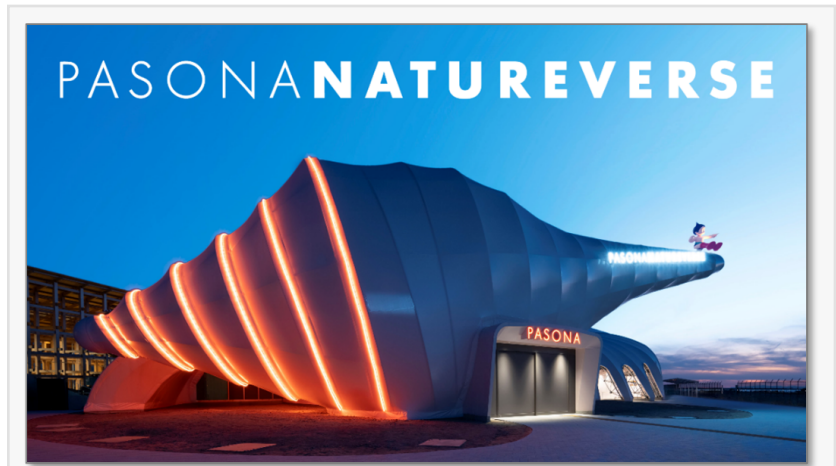
PASONA NATUREVERSE exterior

The lyrics for these two songs, "Thank You, Life" and "To the Future of 8 Billion", were created by weaving together many writings, essays, and words submitted by members of the Pasona Group. I blended and based those thoughts into music to create these songs. I believe that it was fate that allowed us to have Ayaka Hirahara sing, as she was exactly who I imagined when first composing this music. I hope it will make for a big message. I hope we can all sing in unison. I created these songs while believing in the power of music.