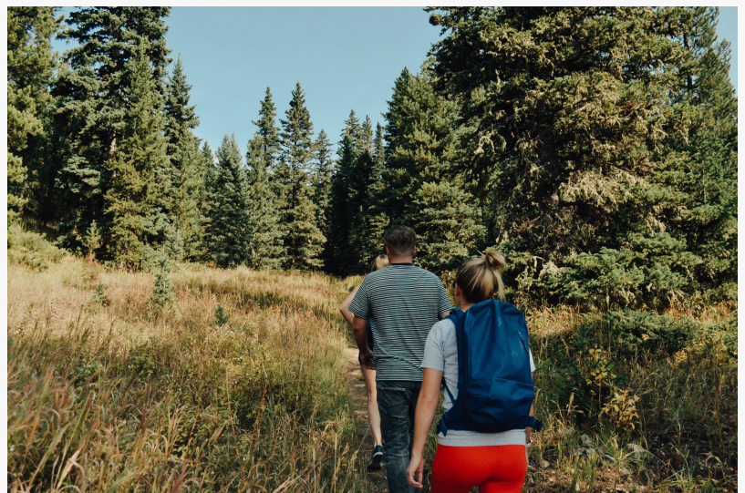
Team hike near Trail Creek, Montana

LIVINGSTON, MT, UNITED STATES, April 1, 2025 /EINPresswire.com/ -- As businesses navigate economic challenges and adjust to the evolving dynamics of hybrid and remote work, Artisan Venture Tours, a premier company specializing in immersive retreat experiences across the U.S and beyond, is emphasizing the continued importance of in-person retreats to foster collaboration, strengthen relationships, and enhance team alignment.