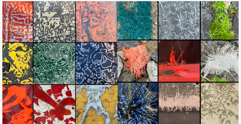
Rhapsody in Graphite by Gina Keatley – a mixed media diptych investigating urban stillness through gestural restraint and layered abstraction.