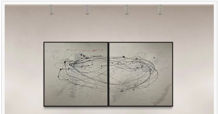
Rhapsody in Graphite by Gina Keatley – a mixed media diptych investigating urban stillness through gestural restraint and layered abstraction.

All Works for Acquisition: bushwickgallery.com/urban-narratives-the-city-as-canvas/