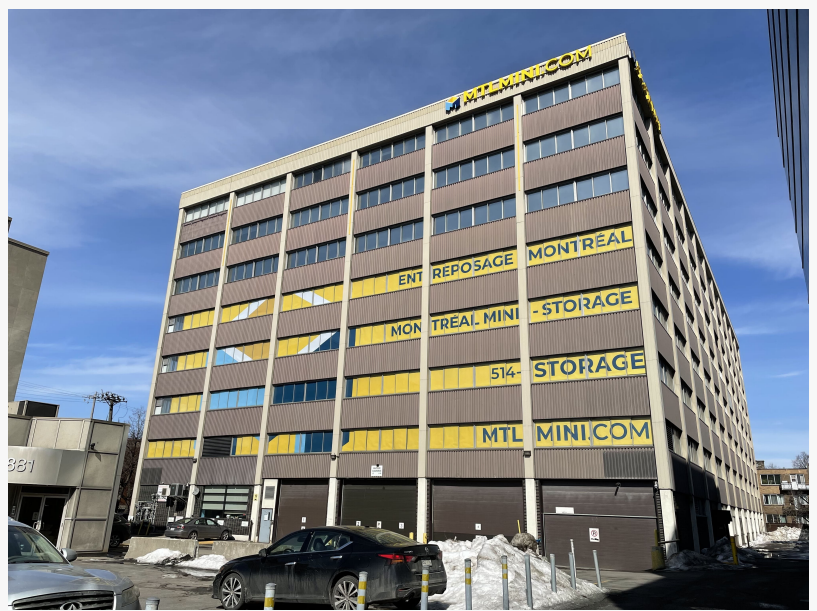
Avenir Properties corporate office in Montreal