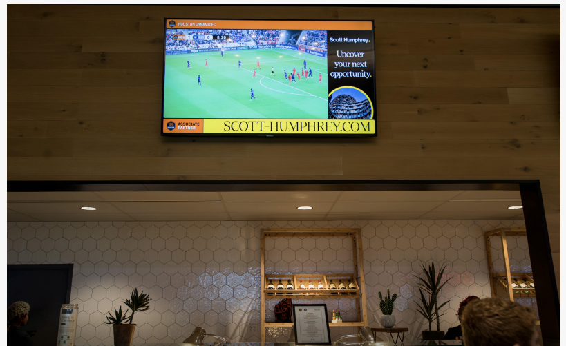
Where Recruitment Meets the Game