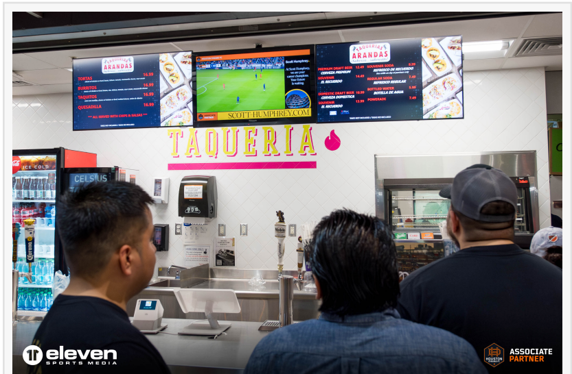
Empowering Teams On and Off the Field