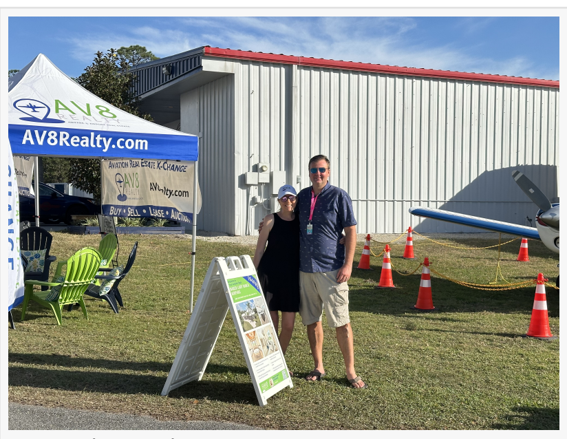
AV8 Realty Booth at Sun N Fun 2025

LAKELAND, FL, UNITED STATES, April 1, 2025 /EINPresswire.com/ -- <u>AV8 Realty</u>, a leading platform for aviation real estate, is thrilled to announce the launch of its innovative MLS integration service. This cutting-edge technology leverages artificial intelligence to sift through tens of thousands of listings on MLS IDX feeds, showcasing only aviation-specific properties—such as airpark homes, hangars, airpark land, and private airports available for sale