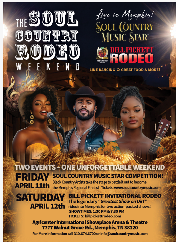
The Soul Country Rodeo Weekend | Two Events | Friday & Saturday April 11th and 12th

On Saturday morning, the BPIRF will host an educational workshop highlighting the significance of agriculture and the diverse career opportunities within the field. Later, during the 7:30 PM BPIR rodeo, BPIRF will