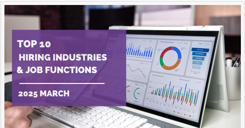
2025 March - Navigating Talent Trends in Myanmar Cover

The list below highlights the top 10 job functions with the most job postings on JobNet.com.mm for March 2025. Whether you're seeking to expand your team, streamline your workforce, or stay ahead in the talent acquisition game, these insights will help you make informed decisions in your recruitment and growth strategies. Discover the most in-demand functions that are shaping the job market and driving success for businesses in Myanmar from highest to lowest: