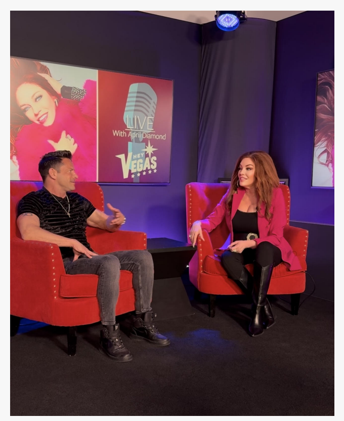
Interviewing Jeff Timmons on Hey Vegas TV (Pompey Entertainment)

it's our chance to have fun together every single day! This year's theme is to make each day the perfect day," says April. "Get ready for 30 Days of April 2025 -