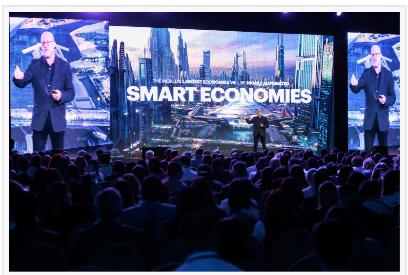
Doing Digital Forum 2025, Future of Money:Economic Impact

YEREVAN, ARMENIA, April 1, 2025 /EINPresswire.com/ -- Reflecting its growing commitment to innovation and technological advancement, Armenia has made significant strides in the global digital economy. In the 2024 Global Innovation Index, the country advanced nine spots to rank 63rd out of 133 nations, reinforcing its innovation capabilities and infrastructure. Meanwhile, the Asian